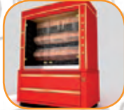
process &amp; cooking equipment