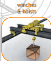
winches &amp; hoists