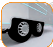
tugs &amp; movers