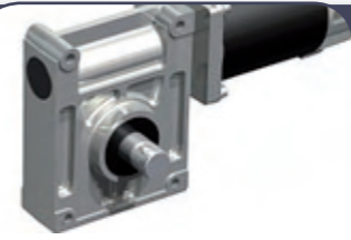
PM63-50GB9 robust unit for wheelchair application