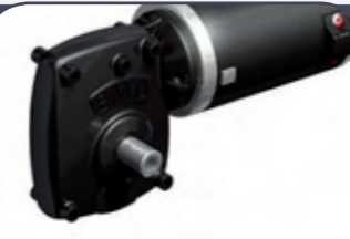
PM50-63GB11 lightweight plastic unit for golf trolley application