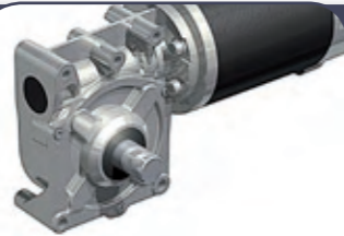
RE90-146GB12 'rare-earth' unit for floor cleaning application

In 2008 Parvalux acquired OEM solutions specialist EMD Drive Systems.