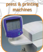
press &amp; printing machines