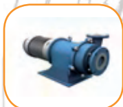
pumps &amp; compressors