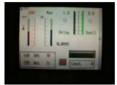
Boot up to default screen with machine status