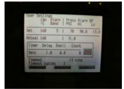
Settings screen for all control parameters