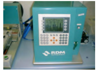
Separate control tower