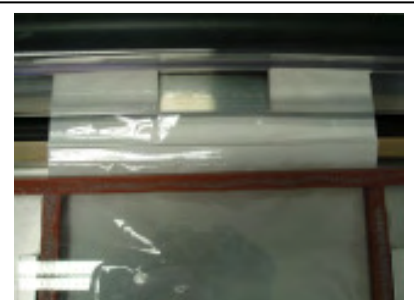
Pouch in place over tong which provides Flushing and vacuum draw.