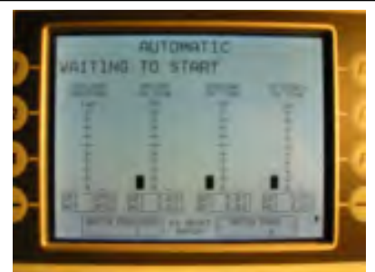
Main screen with bar scale for temperature, pressure and dwell time, flush and vacuum cycles